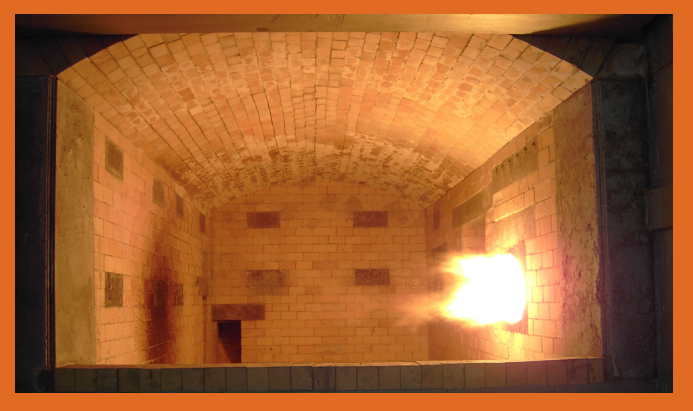
Above, just a couple of examples of work our refractory services team has completed